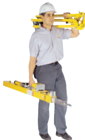
Lift conveniently disassembles for easy transport. Convenient carrying handle!