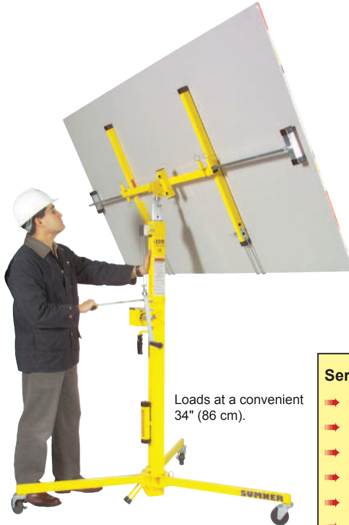
Loads at a convenient 34" (86 cm).