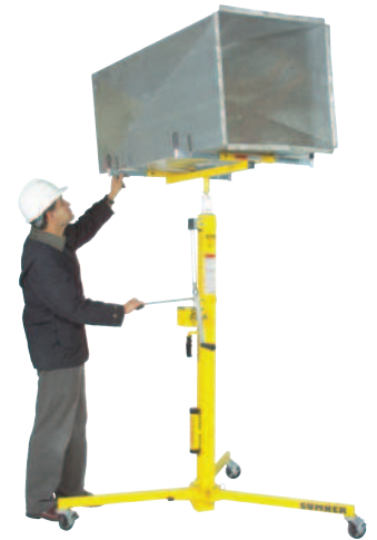
Optional HVAC/ Light Cradle Part No. 784474