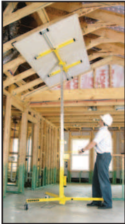
Cradle tilts up to 45° for cathedral ceilings.