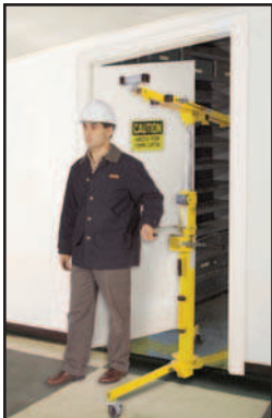
Fits through doorways!