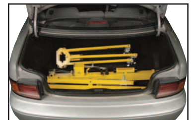
Fits in a car trunk!