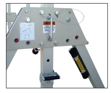
Tool-free A-Frame operation with instructions tube