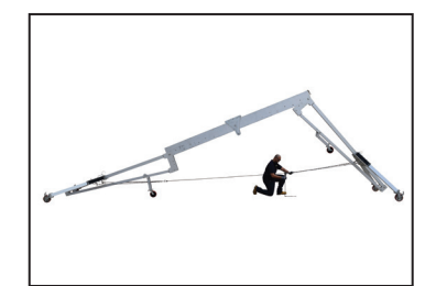
Ratchet 1st A-Frame bolt to beam.

The GH5T comes with chain & ratchet to pull A-Frame legs together.