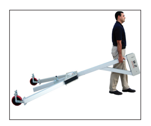
Casters can be locked at 90 degree angle for easy transport