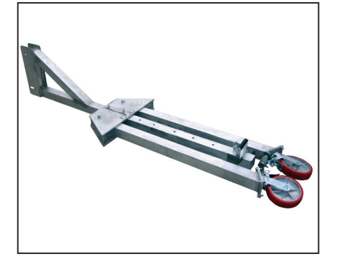
A-frame legs lock in closed position – no bolts