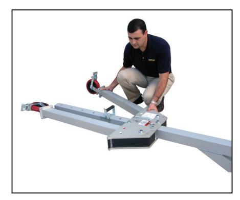
A-Frame legs lock in closed or opened position