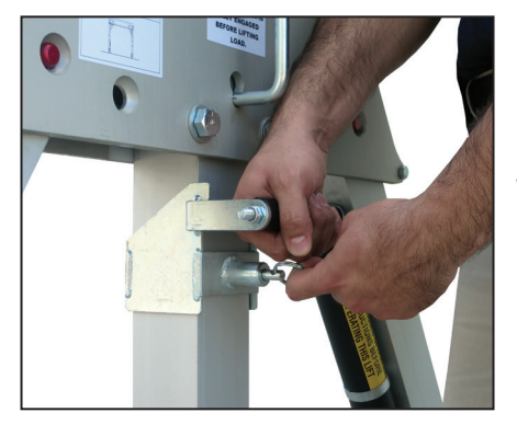
Adjust mast lifting handle with plunger pin to comfortable lifting position