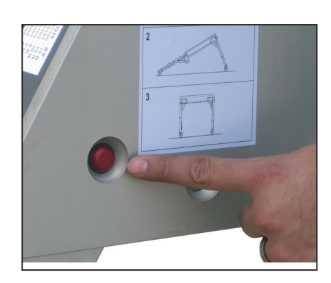
Push button leg lock release & locking