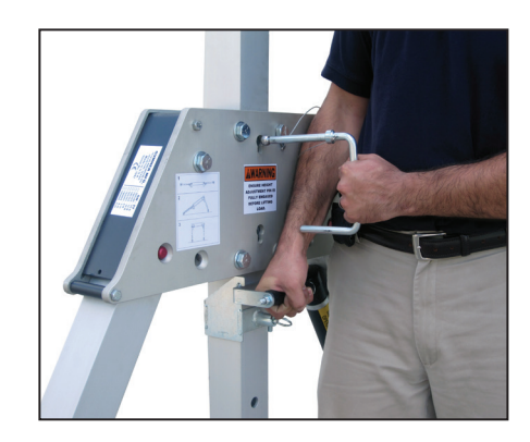
Lift mast and remove quickaction mast locking pin