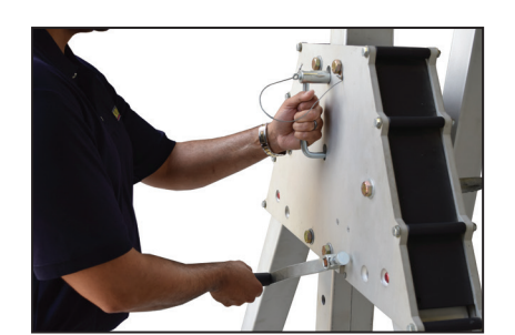
Built in mast winch raises and lowers beam with ease. Mast locking pin sets mast with no bolts.